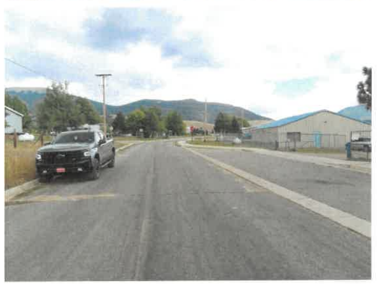
Form DMSLND.SR - "TOTAL" appraisal software by a la mode, inc. - 1-800-ALAMODE