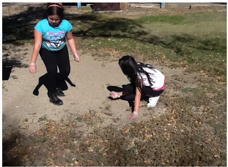
Cimarron Students pick up trash at the park. Cimarron Middle School Student Council is focused on community service.